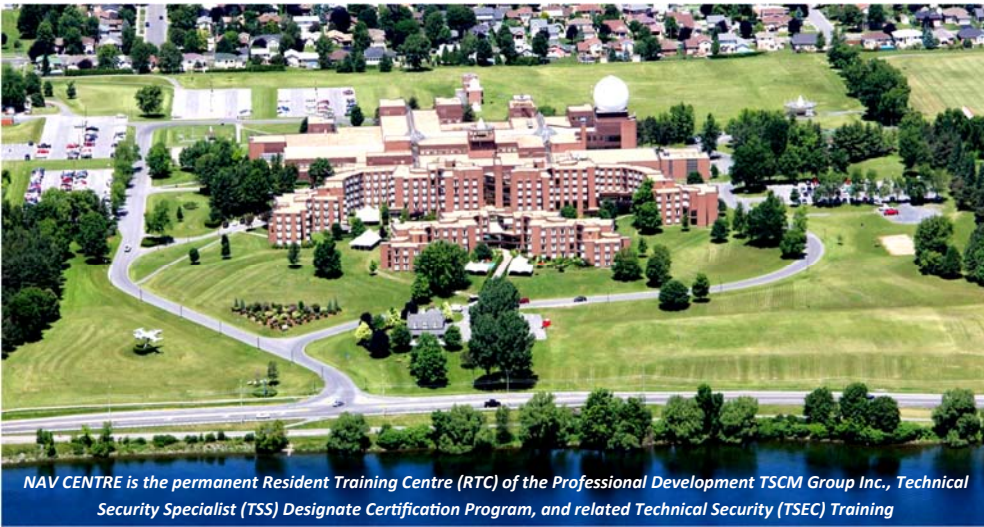
NAV CENTRE is the permanent Resident Training Centre (RTC) of the Professional Development TSCM Group Inc., Technical Security Specialist (TSS) Designate Certification Program, and related Technical Security (TSEC) Training