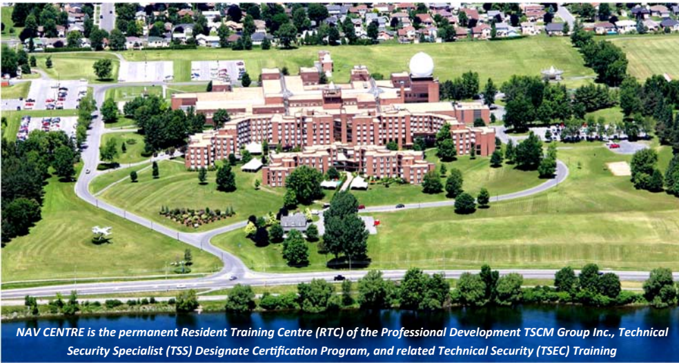
NAV CENTRE is the permanent Resident Training Centre (RTC) of the Professional Development TSCM Group Inc., Technical Security Specialist (TSS) Designate Certification Program, and related Technical Security (TSEC) Training